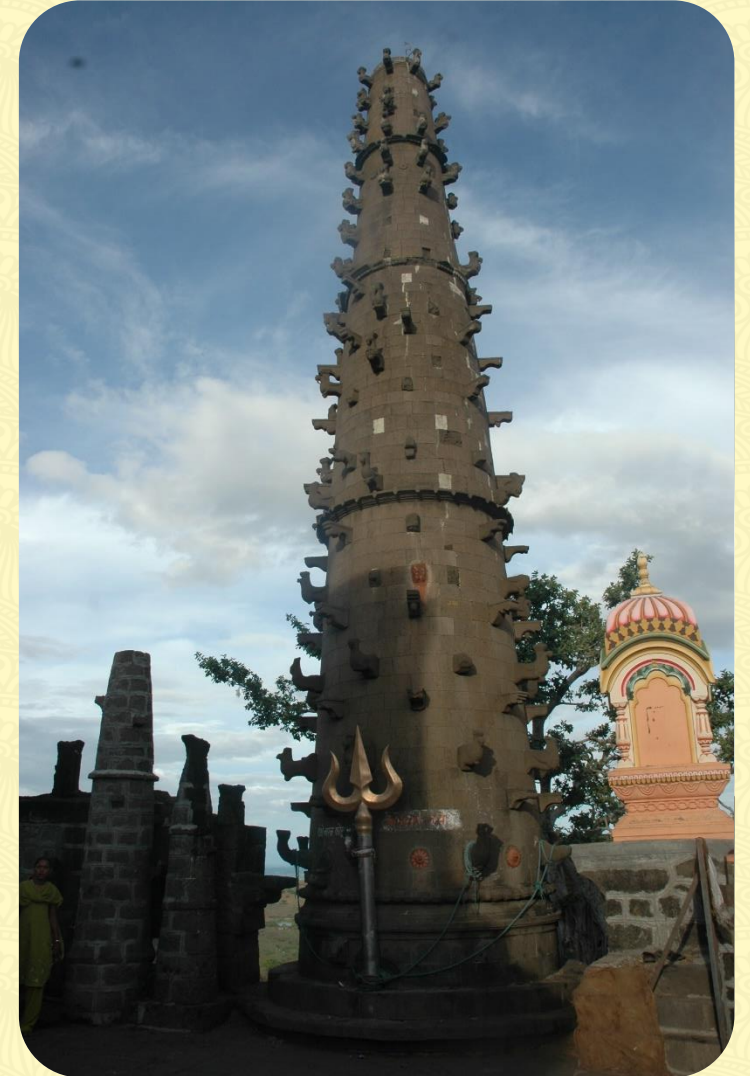
Lamp – DeepMaal