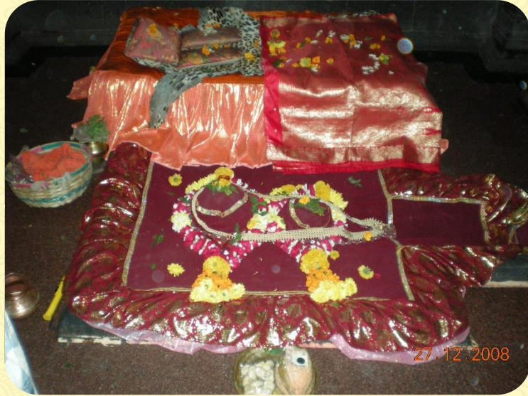
Shej – Sleeping Time