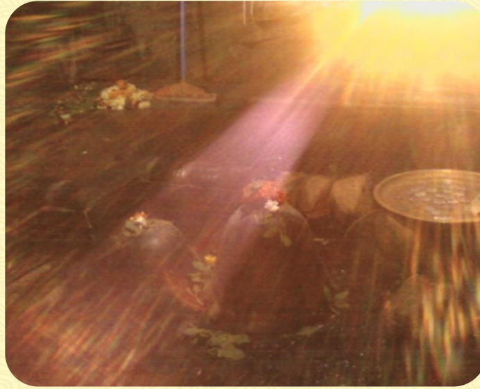
Sun lights on Shiv ling